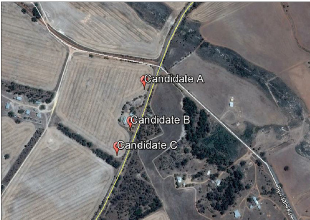
Figure 1 –Telstra Candidate Sites

A summary of the proposed candidates is located below, including a description of the opportunities and constraints that each site afforded.