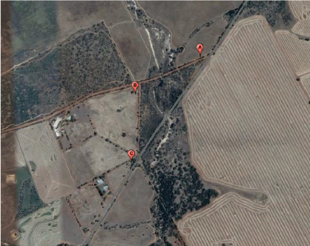
Figure 1 –Telstra Candidate Sites

The below map is an extract from Appendix No. 1, Planning Assessment Report.